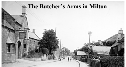
The Butcher's Arms in Milton

The public house can be such a great focal point for village residents and it would be a tragedy if the rest of our pubs went the way of so many. So the message is: if you value it, use it or lose it!