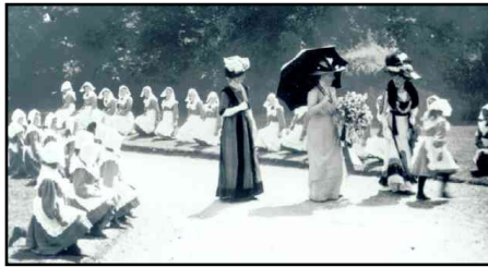
Visit by Princess Victoria of Schleswig Holstein 12 th July 1911

In January 1939 more than 30 boys from the Basque region of Spain made it their home. Their stay was short-lived and it was soon commandeered for military use. During the war it was used to