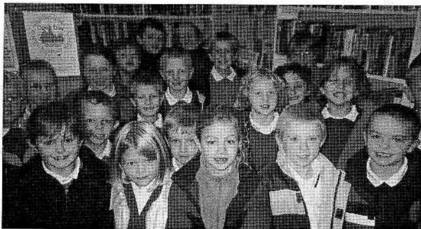
Year three, Wychwood Primary School

The Christmas Raffle held in the Library raised £225.00 for the Wychwood Amenities Fund. Thank you all for your support in this fund raising effort.