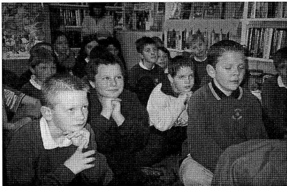
Children from Wychwood School. Taking it all in.

The children from our Wychwood School are busy preparing work which will be entered in a competition. The work may take the form of an essay, poem, or a painting. We wish them good luck with their efforts. If you saw the balloons waving on the great window display, you will now realise what it was all about. I would like to thank the three people who provided the memorabilia of Oxford United and printed the welcome poster. Thank you for your support.