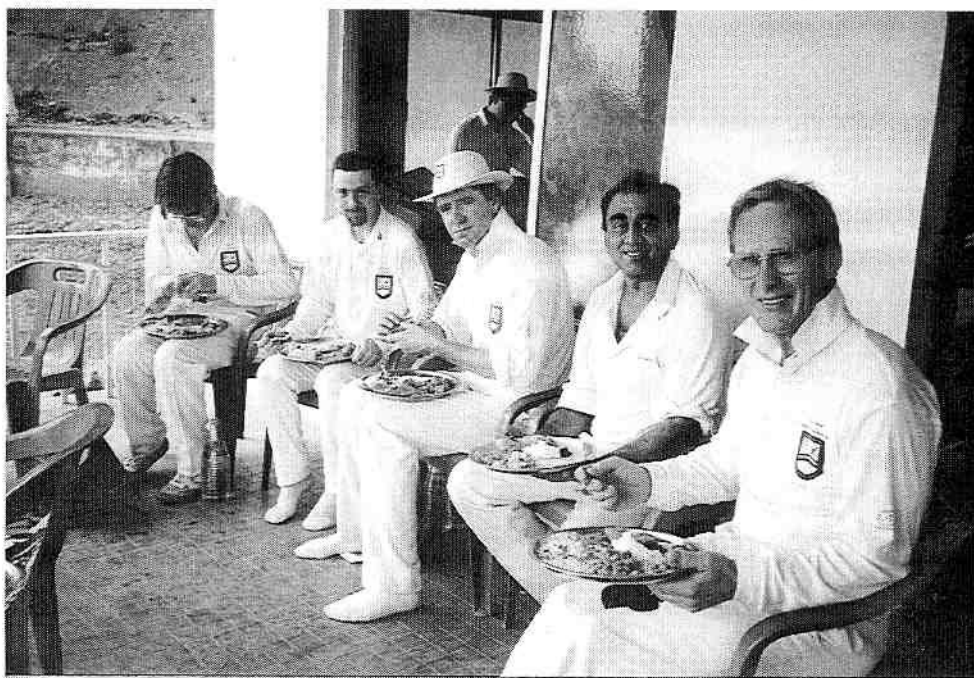
Curry Cricket Lunches !